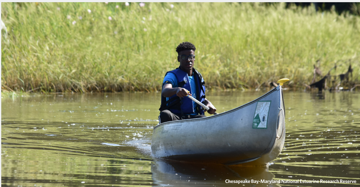
A high school student canoes against a backdrop of salt marsh along the Patuxent River, a tributary of the Chesapeake Bay in the U.S. state of Maryland. Salt marshes are a vital blue carbon ecosystem.